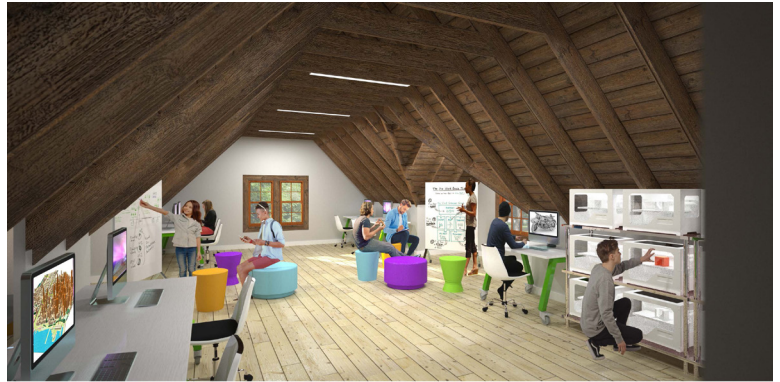
SECOND FLOOR VIEW HERMITAGE MUSEUM & GARDENS VISUAL ARTS SCHOOL RENOVATION SCHEMATIC DESIGN