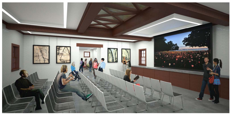
FIRST FLOOR VIEW HERMITAGE MUSEUM & GARDENS VISUAL ARTS SCHOOL RENOVATION SCHEMATIC DESIGN